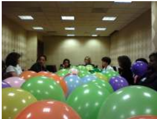
Your CLEA Board @ work